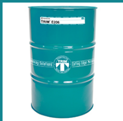
54-gallon drum SKU: E206N/54 UPC-12: 641238003090