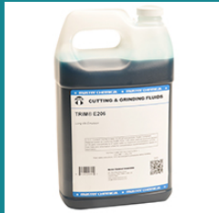
1-gallon jug SKU: E206N/1 UPC-12: 641238003052