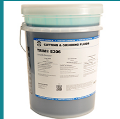
5-gallon pail SKU: E206N/5 UPC-12: 641238003083