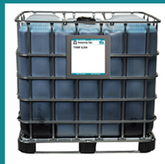
270-gallon tote SKU: E206N/NR270P UPC-12: 641238033882