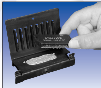
Duralco 132 Dissipates Heat in a Semiconductor Device

* Cures can be accelerated with mild heat.